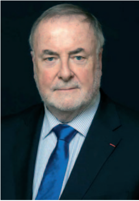
LOÏC FAUCHON PRESIDENT OF THE WORLD WATER COUNCIL

Water is the most precious and essential element in nature, and yet the most fragile. Our planet is full of water, and yet many of its inhabitants are thirsty. This is especially true in Africa. A continent rich in resources and especially rich in skills, passion and energy of the children, women and men who live there, but who are suffering from water scarcity.