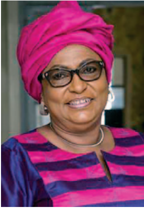
SOHAM EL WARDINI MAYOR OF DAKAR

The city of Dakar, with a long tradition of hosting international events, is honored to have been designated to host the 9 th World Water Forum. Located on the farthest western point of the African continent and known for receptive collaboration with international partners, the city of Dakar is proud to have been chosen and convinced that our cosmopolitan capital has all the necessary infrastructure to ensure the success of this large event. The hotels, transportation and communications networks meet international standards.