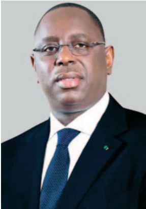
MACKY SALL PRESIDENT OF THE REPUBLIC OF SENEGAL