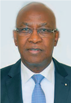
SERIGNE MBAYE THIAM MINISTER OF WATER AND SANITATION

A world that is more aware of water issues is on the move. A certain culture of water citizenship is expected to develop to lay the foundations for sustainable development. Communities and decision-makers at all levels of State, civil society organizations and the private sector, understand that the world is safer with the possibility of having access to water and sanitation services than in a situation of deprivation. This awareness is materialized by international commitments in the field of water. It is now up to all stakeholders to be the guarantors of a culture of preserving and sharing water. The time to organize the 9 th World Water Forum has come!